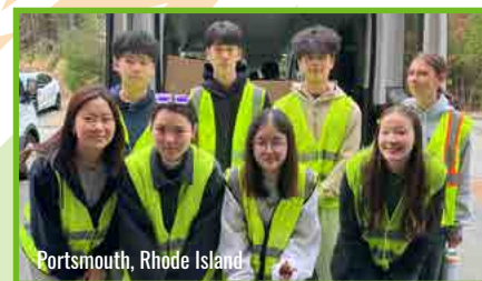
Portsmouth, Rhode Island