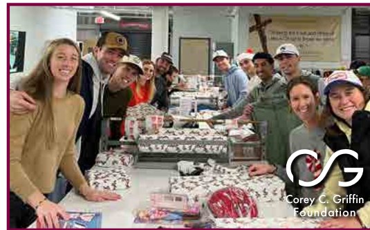
Members of the Corey C. Griffin Foundation's Emerging Leaders Council (ELC) joined us in Santa's Workshop in December. The Foundation's ELC program is for young, Boston-area professionals who are committed to shaping the future of philanthropy.

Thank you to all those who were part of the 2025 Christmas Program in your own special way. We couldn't serve so many families with excellence without you.