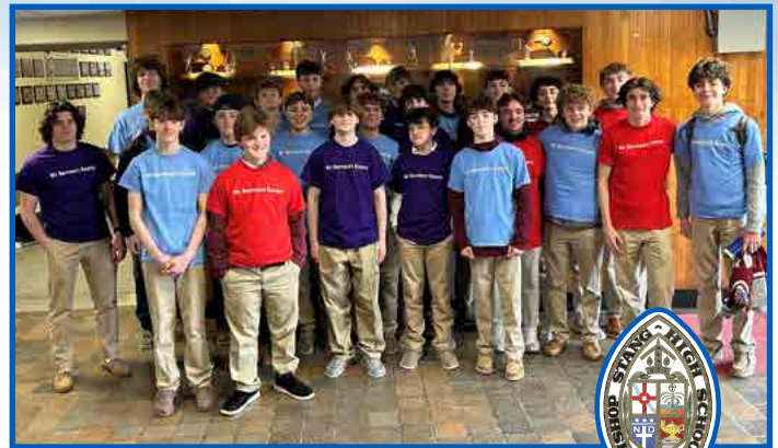
Bishop Stang High School Hockey Team, Dartmouth, Massachusetts