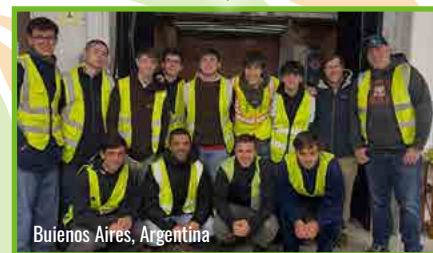
Buenos Aires, Argentina