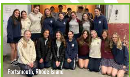
Portsmouth, Rhode Island