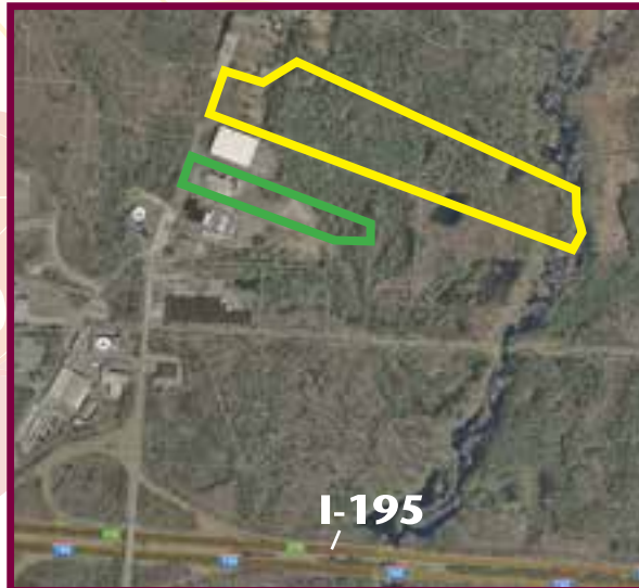
God is Good! Thanks to generous benefactors, My Brother's Keeper recently acquired the 22-acre parcel of property highlighted in yellow. It will be the site of our future home in Dartmouth. The property we currently have under lease through June 2017 is in green.

God bless you and thank you for being part of the My Brother's Keeper family.