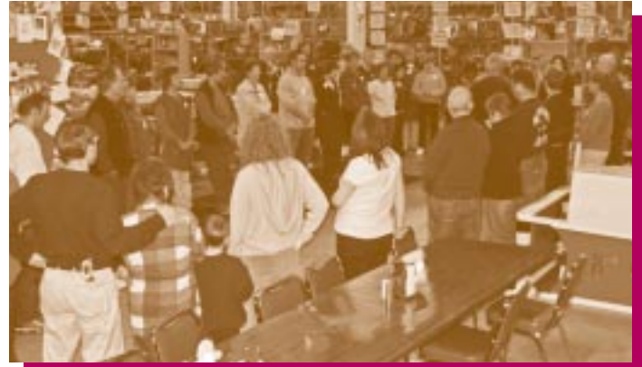
The foundation of My Brother's Keeper is prayer. All the work stops to say Grace together before lunch. (See related story, page 5)