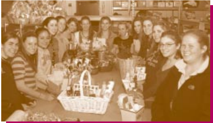
14 seniors from Oliver Ames High School in Easton donated time and money to make gift baskets for the teens we serve.