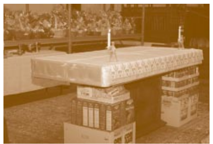
This altar, used during our Annual Gratitude Mass, is constructed of a boxspring, a dresser, and food which will be given to families we serve. More than 425 supporters attended this year...our biggest crowd ever!